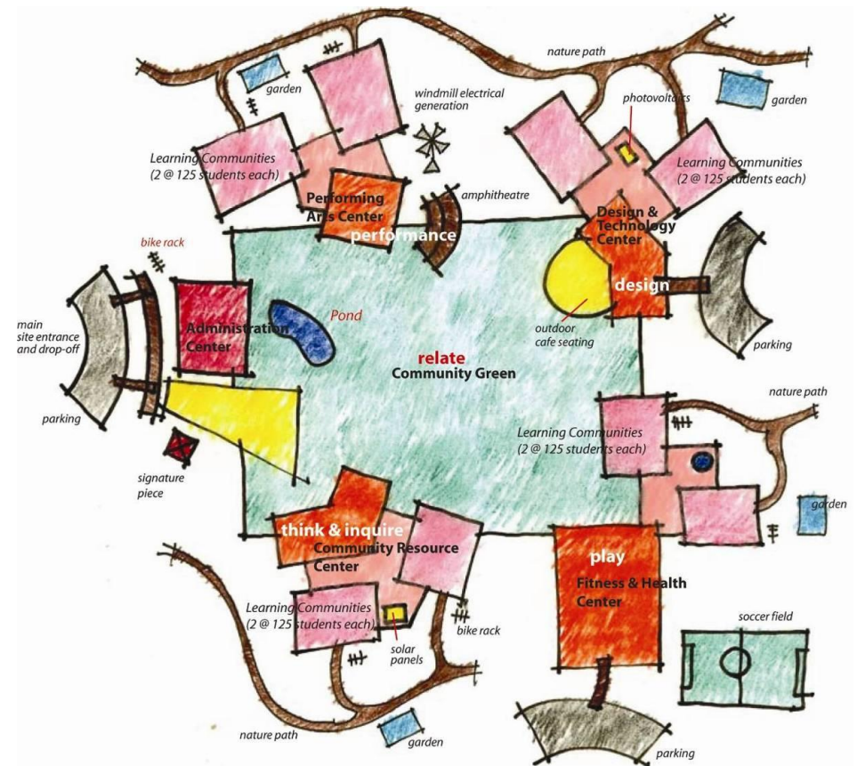
BENDIGO SECONDARY SCHOOLS - PRELIMINARY SITE CONCEPT